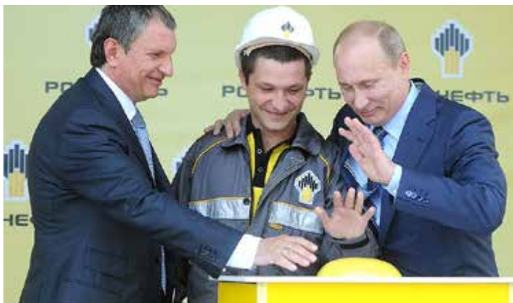
Various sets of sanctions rules and the guidance associated with them have caused confusion. In a 2017 case involving Rosneft, the European Court of Justice clarified the previously vague term "financial assistance" in relation to technologies relevant to the oil and gas sector. Rosneft's chairman Igor Sechin is pictured above with a company employee and President Vladimir Putin in 2012.

Policy leaders in the United States and in the European Union should take several steps to sustain the strategic utility of sanctions to their foreign policy posture as concerns with Russia's international aggression, adventurism, and intrusions proliferate. These steps involve measures to sharpen sanctions as a policy instrument, making them more effective and targeted. The steps also involve measures to uphold and strengthen coordination on the craft and enforcement of sanctions to enhance the cogency of the measures and reduce the potential for evasion. Private sector leaders also have a role to play in ensuring that sanctions are clear, implementable, and effective. Specific recommendations for U.S. policy-makers, including the administration and Congress, as well as private sector leaders, are presented below. They are followed by recommendations for European policy leaders in Brussels, as well as member-state national leaders and private sector representatives.