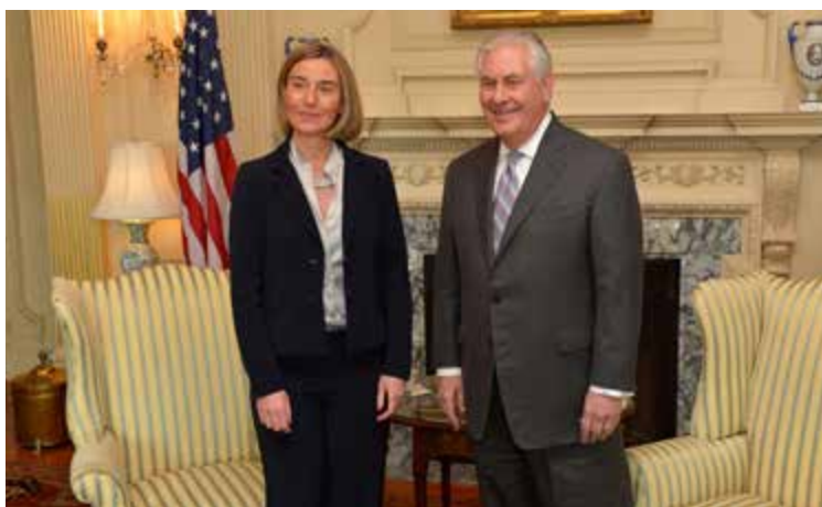
Transatlantic leaders, such as High Representative of the European Union for Foreign Affairs and Security Policy Federica Mogherini and U.S. Secretary of State Rex Tillerson, have surprised Russia by showing unity in maintaining sanctions even while transatlantic resolve on the measures has shown some cracks.

Nevertheless, notwithstanding broad political unity on both sides of the Atlantic and the economic costs that sanctions have imposed on Russia, experts disagree about the impact of sanctions on Russia's strategic decisionmaking. Russia has not complied with its obligations under the Minsk agreement, including withdrawing heavy weapons from eastern Ukraine and restoring Ukrainian sovereignty along the Russia-Ukraine border. 6 However, U.S. and European officials, as well as a number of independent analysts, have argued that the sanctions