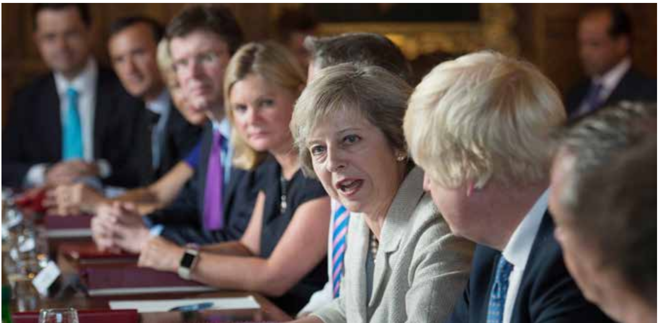
It seems unlikely that the post-Brexit United Kingdom, led by Prime Minister Theresa May, will adopt a stronger sanctions policy that would damage its economic prospects with Russia and offer no clear national benefit.

Ultimately, while rhetoric may vary as politicians seek voter support in an increasingly fragmented and nationalistic European political landscape, it is in the interests of neither the U.K. nor the EU to take diverging sanctions policy positions against Russia. In a turbulent time, policy toward Russia might be one of the few areas of stability.