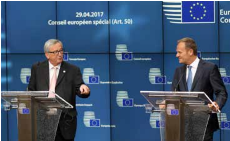
Although post-Brexit coordination of Europe-wide sanctions policy will be difficult, showing weakness on Russia would be unwise. At a press conference, President of the European Council Donald Tusk and President of the European Commission Jean-Claude Juncker address the implications of British invocation of Article 50.

the EU. To date, the U.K. has played a key role in exerting persuasive influence in Brussels to bridge this divide.