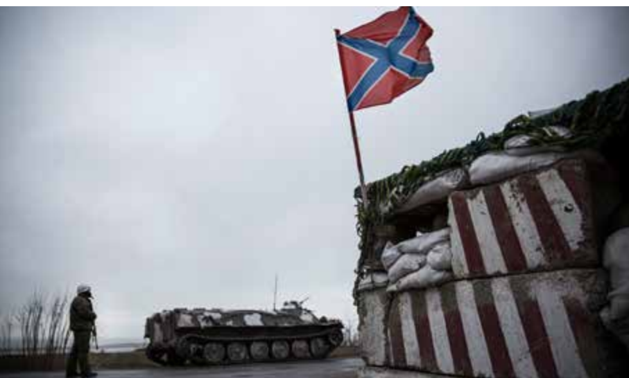
Russia's annexation of Crimea and aid to separatists in eastern Ukraine precipitated the Ukrainian crisis and led to the imposition of transatlantic sanctions. Here, a separatist mans a checkpoint in eastern Ukraine.

This paper reviews the current transatlantic sanctions on Russia and the economic impacts they have had on Russia and, to a lesser extent, on the countries that have imposed the sanctions. By surveying recent political developments in Europe and the United States, the paper explores scenarios and considerations for the future of transatlantic sanctions. It concludes with recommendations for policymakers in the United States, in Brussels, and in EU member states on how to adapt sanctions to address a variety of unintended economic factors and the proliferating threats from Russia.