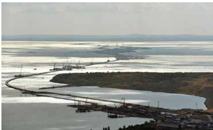
Russia is constructing of an 11-mile bridge across the Kerch Strait to connect the annexed Crimean peninsula to the Russian mainland.

In addition, both European officials and the new Trump administration have sharply criticized both Russia's support for President Assad and its possible complicity in Assad's use of chemical weapons in April 2017. 32 Finally, anger at Russia's intervention in the 2016 U.S. presidential election and European concerns about Russian intervention in EU elections in 2017, including the role of Russian media organizations in spreading disinformation across the continent. As a consequence, the European and U.S. sanctions on Russia appear likely to remain steady for the near and mid terms, and perhaps increase as a mechanism of foreign policy to counter Russian aggression.