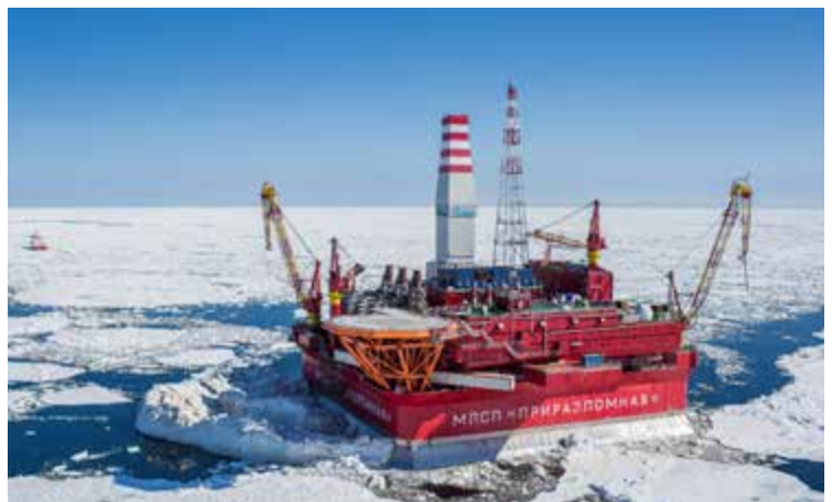
Sectoral sanctions have placed limitations on EU and U.S. companies providing equipment and services to Russian Arctic oil development projects, including Gazprom Neft's Prirazlomnoye project.