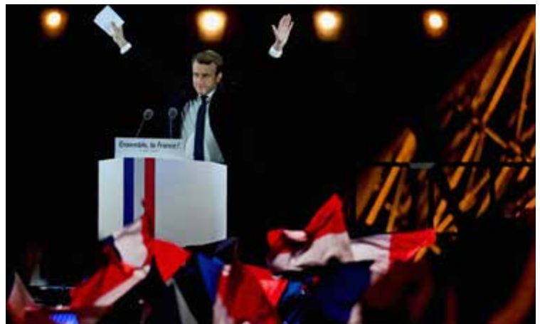
The victory of Emmanuel Macron in the 2017 French presidential election suggests there will be stability in European economic sanctions on Russia.

Despite these major political changes in Washington and Europe, Russia's ongoing aggression has helped to maintain political support for economic sanctions against the Russian government. Russia has followed through on its annexation of Crimea and maintained its destabilizing presence in Ukraine. It has begun construction of an 11-mile bridge across the Kerch Strait to connect the annexed Crimean peninsula to the Russian mainland and continues to supply separatists in Eastern Ukraine with military hardware. 29 Indeed, Russia appears to have modestly re-escalated the military conflict in eastern Ukraine in early 2017. 30 U.S. and European leaders have recently renewed their calls for Russian compliance with the Minsk agreements and their commitment to continuation of transatlantic cooperation on countering Russian aggression in Ukraine. 31