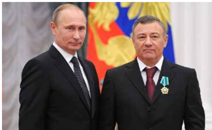
Even though he was under sanctions, in 2014 Arkady Rotenberg, here with President Putin, was able to sell corporate interests to his family. It remains unclear whether he still exercises control or influence over these interests.