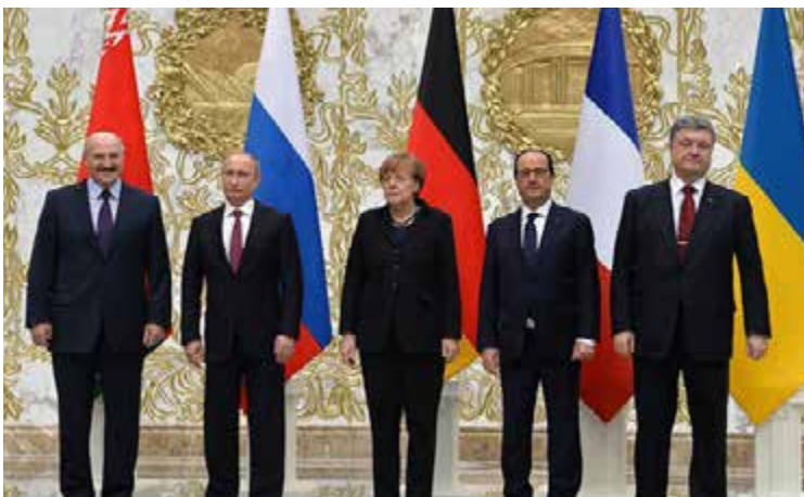
Both U.S. and EU leaders have made compliance with peace agreements decided at a summit in Minsk in 2015, pictured above, a condition for the lifting of sanctions.

Although policy leaders attempted to harmonize the U.S. and European sectoral sanctions, there are a number of technical differences in the ways that the two jurisdictions framed their economic sanctions. One of the most notable differences is the grandfathering provision in EU sanctions, which allows companies within the EU to continue to perform contracts that were concluded