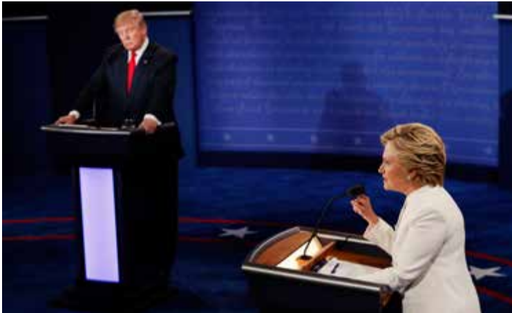
Anger at Russia's intervention in the 2016 U.S. presidential race between Donald Trump and former Secretary of State Hillary Clinton has added to transatlantic skepticism of Russian intentions.

violations of Ukrainian sovereignty will remain in place for the foreseeable future absent Russia's fulfillment of its obligations under the Minsk peace agreements. These existing measures include sanctions against providing equipment and expertise to Russian Arctic, deep-water, and shale oil projects; sanctions against lending to most Russian banks and oil companies; and sanctions targeting Russian defense companies and business sector cronies of President Putin.