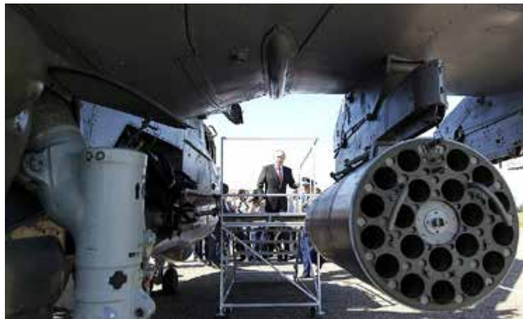
Sanctions have hampered the modernization of Russia’s defense industrial plants and forced it to rely on import substitution. Combined with low oil prices, transatlantic sanctions have also contributed to projected defense expenditure cuts over the 2017–2019 period. In 2012 President Putin visited Russia’s 393rd Air Force base.

Additionally, other players, particularly from Asia, have stepped in to finance oil and gas projects where Western corporates cannot. China’s recently created Silk Road Fund bought a 9.9 percent stake in the Yamal LNG plant, in a deal that delivered much-needed funding after